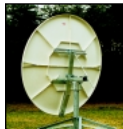
Back View Series 1194

Prodelin Corporation is the world's largest manufacturer of Rx/Tx VSAT antennas. We have the broadest product line in the industry including Receive Only, Rx/Tx and Rural Telephony antenna systems. Prodelin offers nineteen antenna sizes, 47cm to 4.5M. Prodelin is the leader in obtaining type certifications and approvals for Intelsat, AsiaSat and Eutelsat. Prodelin antennas provide the best quality in the market due to the sophisticated, precision SMC compression molding process technology. Prodelin provides the best value antenna solution to the market with competitive prices, the highest quality products and superb engineering support. Prodelin is ISO registered, KEMA # 70022.01. Prodelin - The Market Leader in VSAT Antennas.